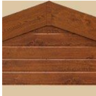
PVCu Light Oak